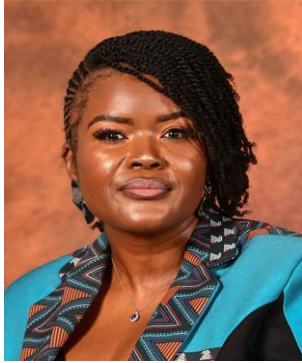
The Honourable Dr Nobuhle Pamela Nkabane, Minister of Higher Education, South Africa