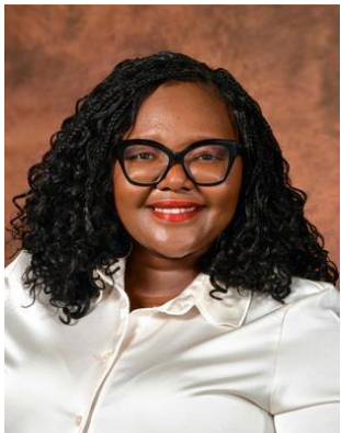
The Honourable Ms Siviwe Gwarube, Minister of Basic Education, South Africa